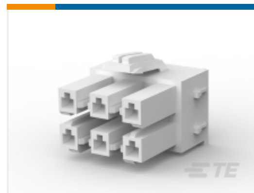
TE Part # 5-179862-1 AMP POWER D/LOCK PLUG HSG 6P (GWT)