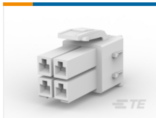
TE Part # CAT-P87024-P729 STD Temp Power Double Lock Plug